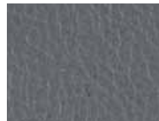
Medium Flint Leather Available