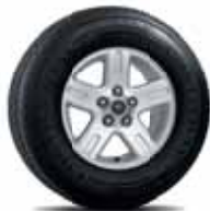
16" Aluminum Wheel Standard