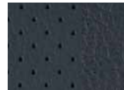
Dark Flint Premium Leather with Perforated Inserts Standard on Premium Package