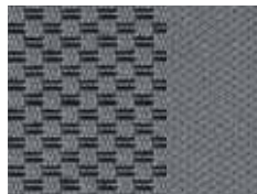
Medium/Dark Flint Premium Cloth Standard