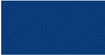
Sonic Blue Metallic