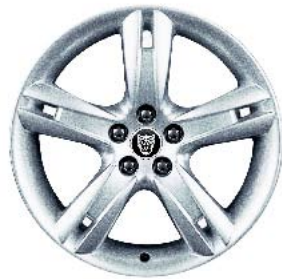
18" cast alloy-Vulcan