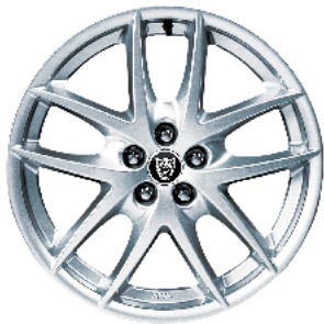
19" cast alloy-Barcelona