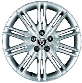
18" cast alloy-Triton